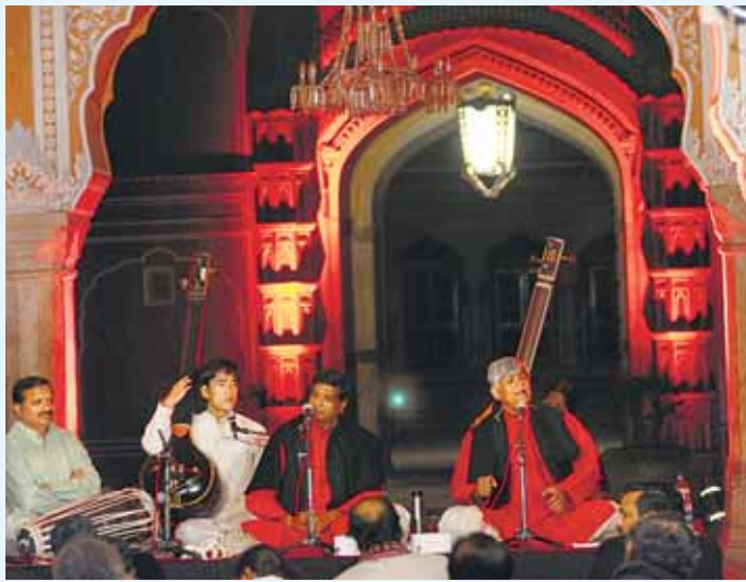
The Gundecha brothers enthralled the city at City Palace on Wednesday with their renditions from Sam Veda and compositions in raag Shuddha Gandhar and raag Charukeshi

"The first time, these people will just come and sit. If they come a few more times, they'll begin to enjoy dhrupad. Thus, their