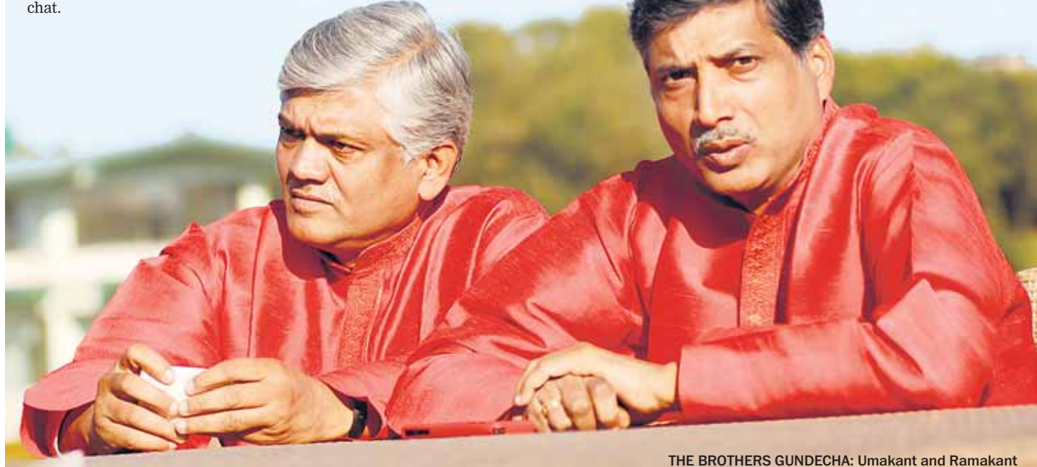
THE BROTHERS GUNDECHA: Umakant and Ramakant