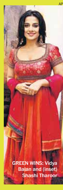
GREEN WINS: Vidya Balan and (inset) Shashi Tharoor